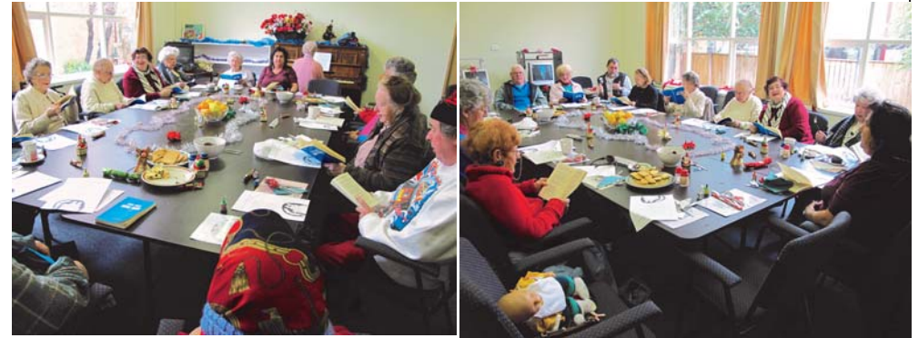
Christmas in July at The Friendship Club